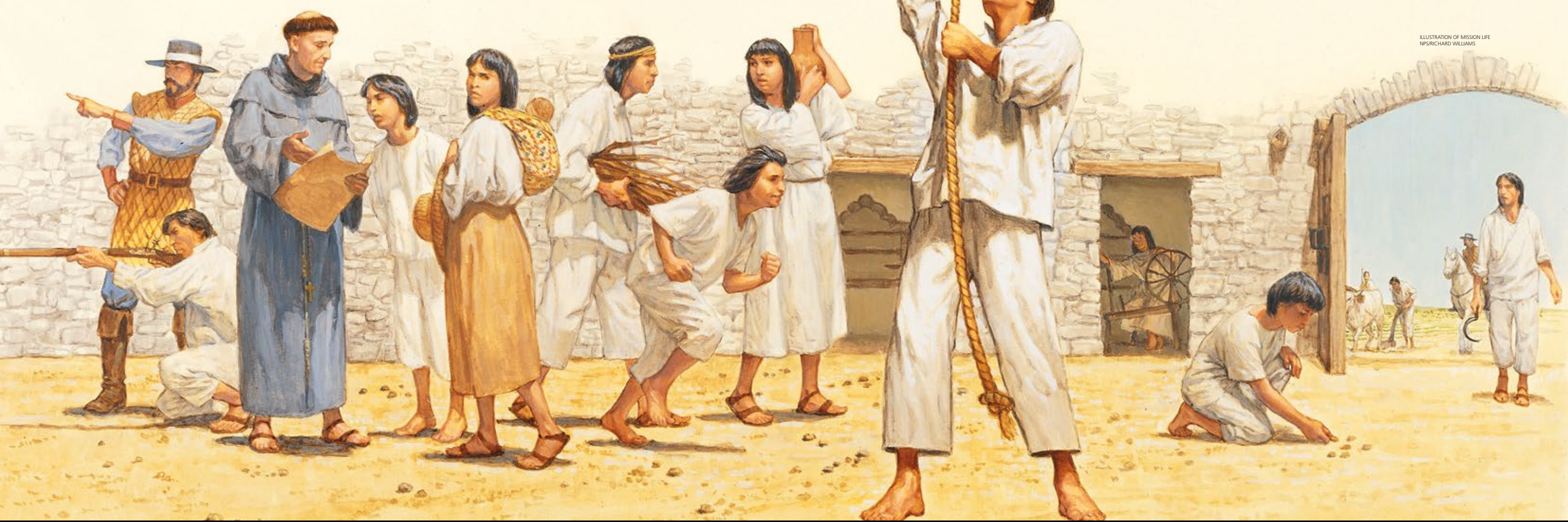
ILLUSTRATION OF MISSION LIFE

Discipline—religious, social, and moral—was the essence of the mission system. Although some Coahuiltecan fled the missions to return to their old life, most accepted Catholicism and actively took part in Spanish society.